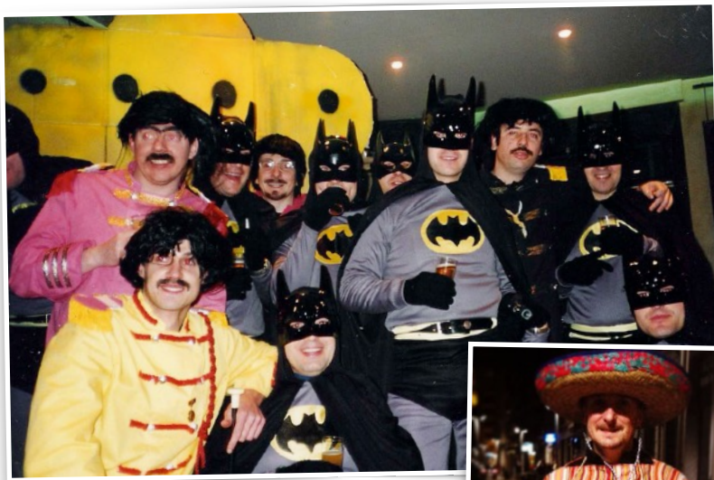
Can you describe these costumes?